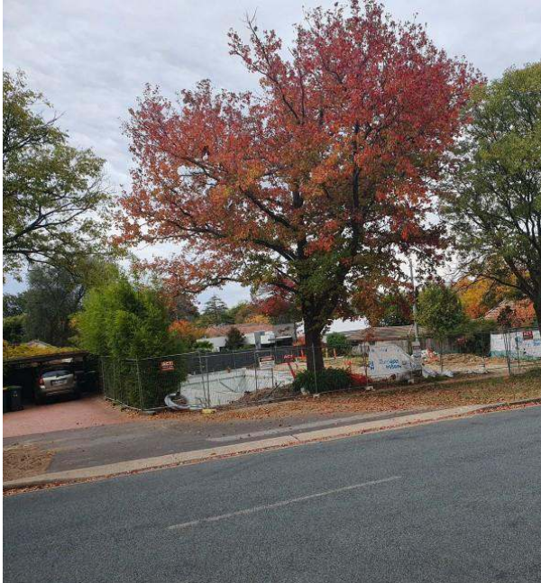
24 Barrallier Street Griffith