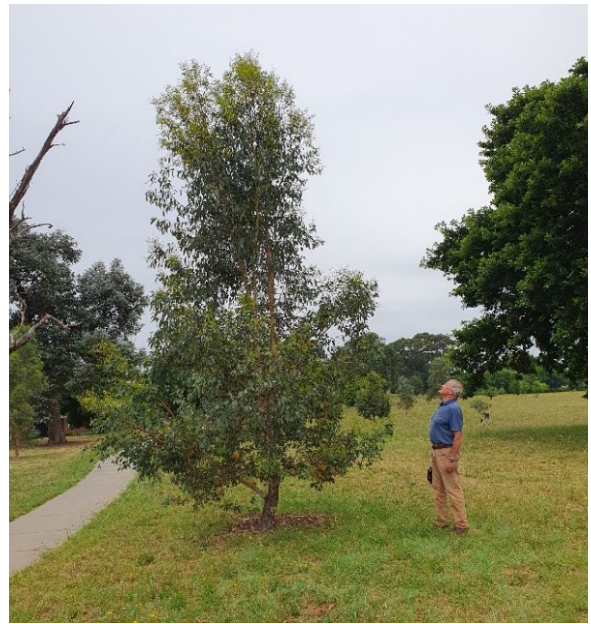
Convenor of the Friends of Blaxland Park, Mac Howell, stands by a E polyanthus in March 2020 (L) and January 2023 (R) as he watches the Red Box grow.

Friends of Blaxland Park was formed in 2017 and have planted more than 60 trees since then. These have been a mixture of native and exotic trees. Funds were obtained from the ACT Government to start a small native garden. To join the Friends of Blaxland Park, contact Mac Howell at mac.howell@iinet.net.au