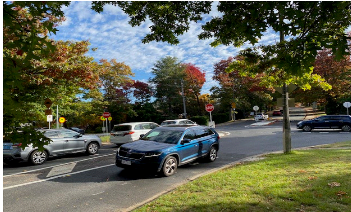
New signage and calmers at the La Perouse St/Carnegie Crescent intersection

Busy Intersection We are pleased to note that there have been no crashes at the busy La Perouse Street /Carnegie Crescent intersection since the traffic calming measures were installed earlier this year (see below). Let's hope this outcome continues.