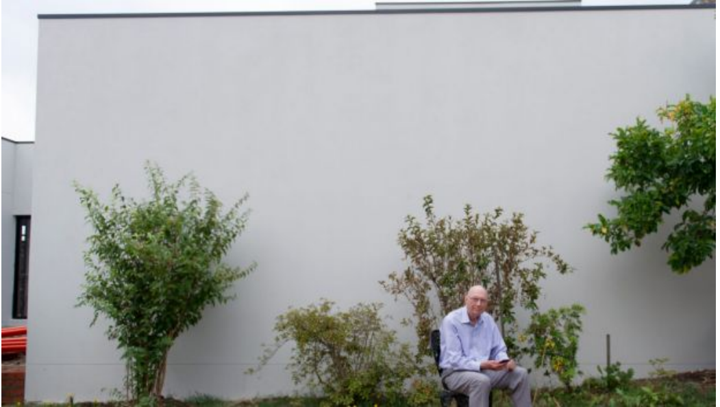
The 4.3 m high wall on the southern boundary of 16 Landsborough Street. It has severely restricted solar access to the neighbour's house.

On closer examination it turned out that, not only was the wall too high, and the plot ratio exceeded, but the building envelope on the approved DA was exceeded at both the northern and southern boundaries and set-backs at the rear and the front of the block are also non-compliant by up to 1.5 m.