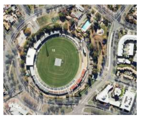
Figs 1a &1b Manuka Green scheme on left, aerial view of Manuka Oval, both at 7/4/16

The Manuka Green proposal would significantly increase the population density in the Kingston, Griffith and Barton suburbs. We need a good turnout at the meeting to show that the community is concerned and also to obtain information as to how the proposal will be evaluated; particularly with respect to the process for dealing with