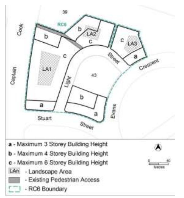
Fig 2b Final zoning for Stuart Flats site (Light Street Precinct).