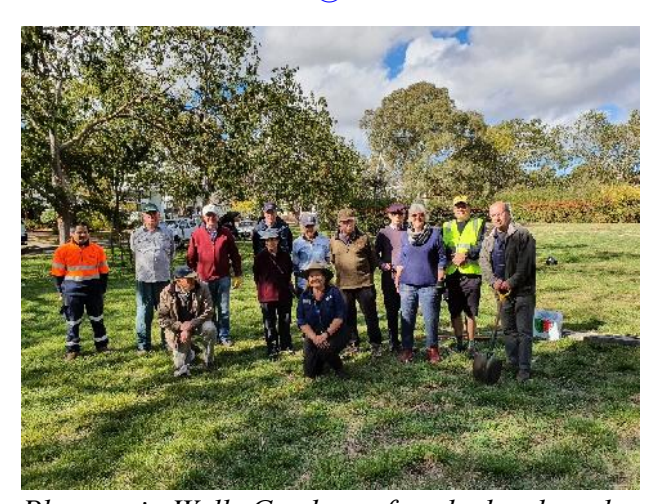
Planters at Blaxland Park after planting 29 trees.