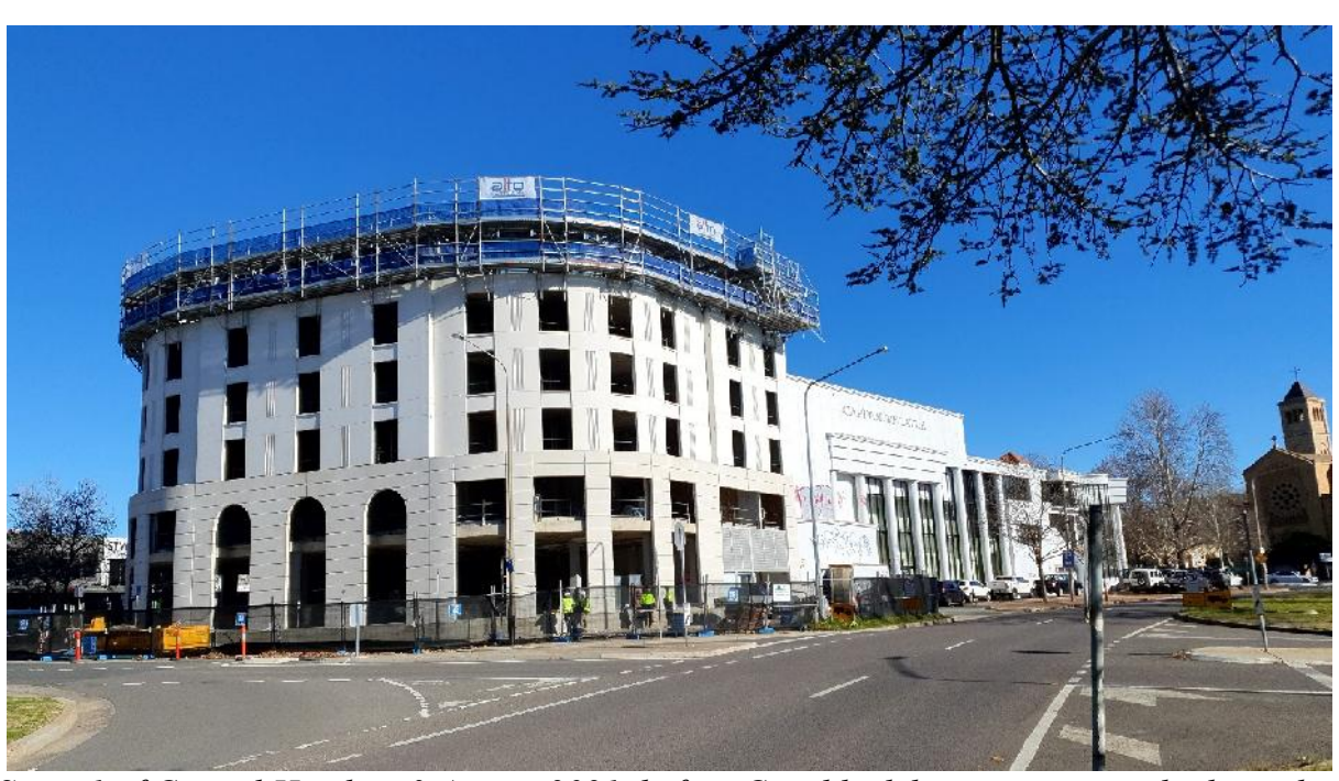
Stage 1 of Capitol Hotel on 3 August 2021, before Covid lockdown, starting to look good.

The ACT Government has now approved the construction of Stage 2 of the new Capitol Hotel in Manuka. However, this is subject to 12 Conditions specified by ACTPLA. Several of these were related to actions the developer must undertake before commencement of work and should be easy to comply with. For example, finalising the parking and traffic management plan during construction and the Stormwater Management Plan should not be difficult. Then there is approval to be obtained from Evoenergy and Icon water, that should be easy as well.