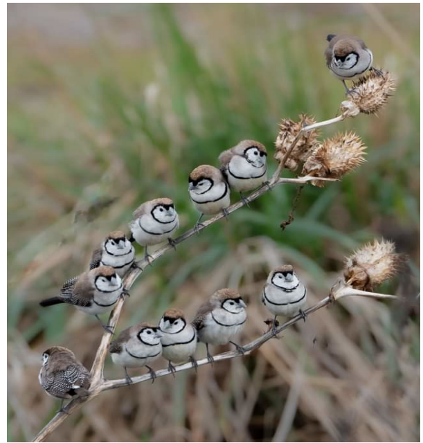
Double-barred finches at Jerrabomberra Wetlands

East Lake is identified by the ACT Government as an ‘area of change’ in the Inner South District Strategy. According to the Government, the Causeway Area represents the first stage of the urban renewal project at East Lake. “The proposed amendments enable future redevelopment of The Causeway Area, facilitating an increase in population while preserving The Causeway Hall, and protecting the Jerrabomberra Wetlands and Lake Burley Griffin from the impacts of development.” According to City News (1 February 2024), the plan is to build up to 1500 new homes in the Causeway. This is equivalent to an increase in population of about 3300 people.