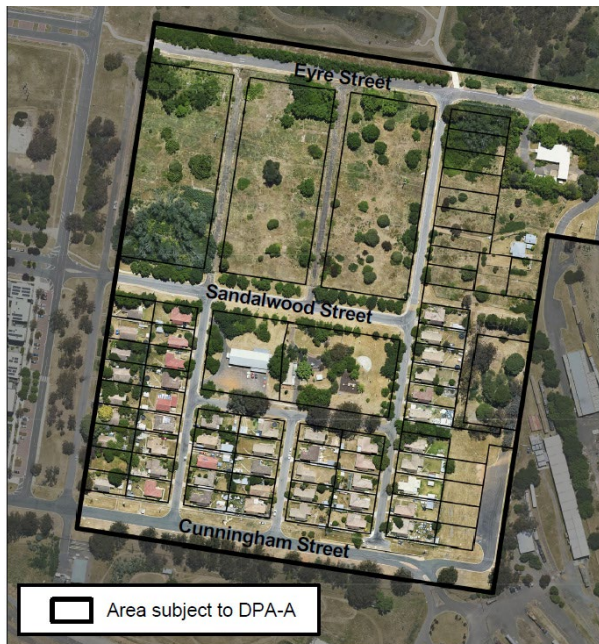
The subject area is bounded by Eyre St, Cunningham St and The Causeway