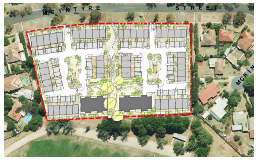
Indicative Concept Plan for Gowrie Court; two story townhouses and two 6 story towers.