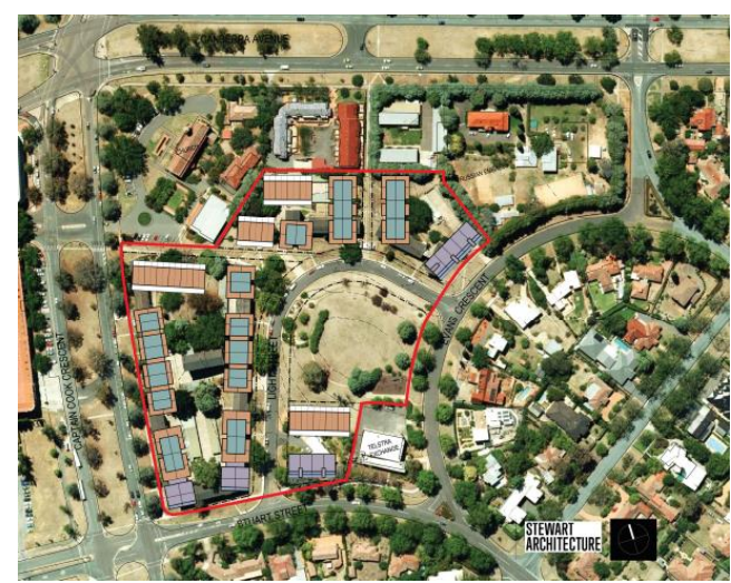
Indicative concept plan for Stuart Flats. Heights of buildings range from two to six stories. See our website for details.

At that stage there will be an opportunity to comment on issues such as the height of the buildings, parking facilities and solar access. It is a long process, but hopefully it will be worth the effort and we will finish up with good quality developments.