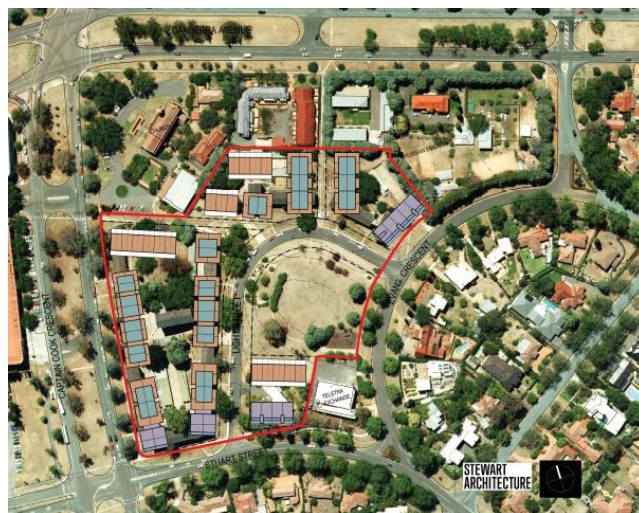
Indicative concept plan for Stuart Flats. Heights of buildings range from two to six stories. See our website for details.

At that stage there will be an opportunity to comment on issues such as the height of the buildings, parking facilities and solar access. It is a long process, but hopefully it will be worth the effort and we will finish up with good quality developments.