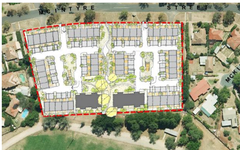
Indicative Concept Plan for Gowrie Court; two story townhouses and two 6 story towers.