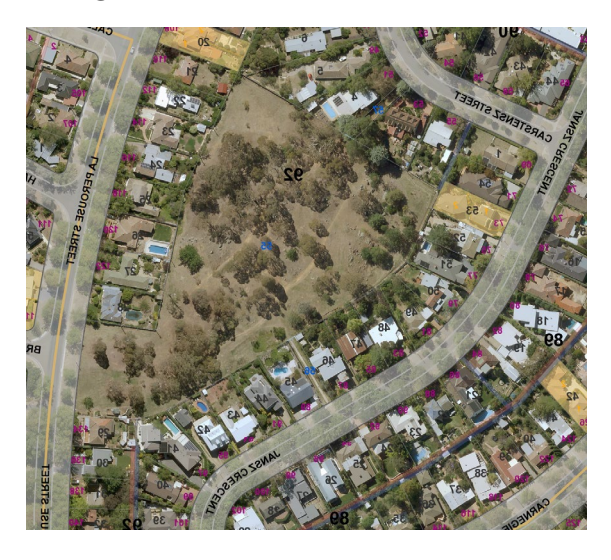
Images of Blaxland Park (left), where tree planting is a priority and Griffith Woodland (right), which is being re-generated. (images are at different scales)