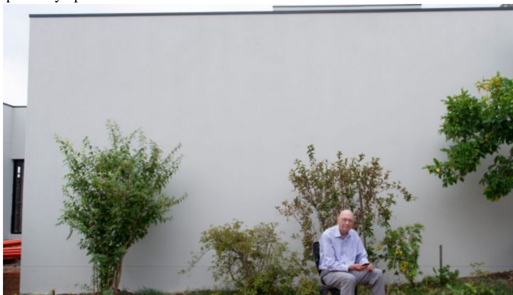
The 4.3 m high wall on the southern boundary of 16 Landsborough Street. It has severely restricted solar access to the neighbour's house (Image courtesy Fairfax Media).

On closer examination it turned out that, not only was the wall too high, and the plot ratio exceeded, but the building envelope on the approved DA was exceeded at both the northern and southern boundaries and set-backs at the rear and the front of the block are also non-compliant by up to 1.5 m.